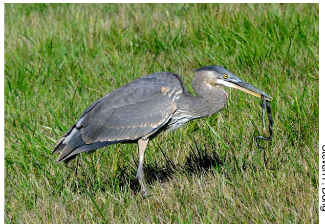
Heron catches snake