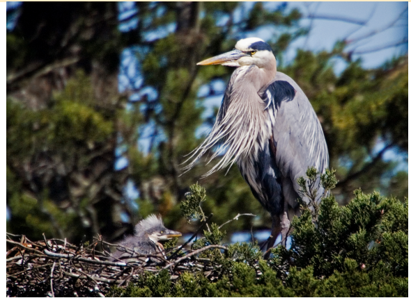
Great Blue Heron adult and chick