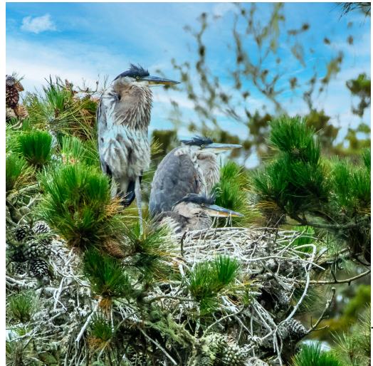
3 chicks in healthy tree on waterfall island in 2023