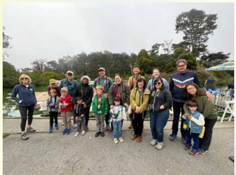
Birding for Families- Blue Heron Lake, Aug. 3, 2024