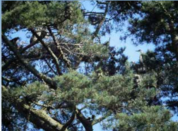
Nest #1 at left, nest #2 at right