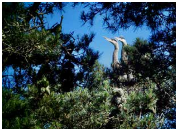
Nest #2 - 2 of 3 chicks visible at end of May

Stay tuned for Heron Watch 2025 6 Saturdays in April & May 10-1PM.