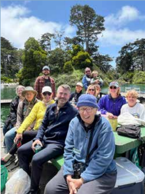
Volunteers enjoy a picnic on their last day!