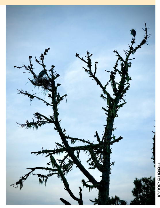
Great Blue Herons arrive at Stow Lake on Jan. 8, 2024

Tax ID no.: 54-2111941. Membership: Adults, $35; Seniors 65+, $30. Joint Membership for two seniors at same residence $50; students 21 or under, $25. Email: <a href="mailto:info@sfnature.org">info@sfnature.org</a> tel.: 415-205-0776