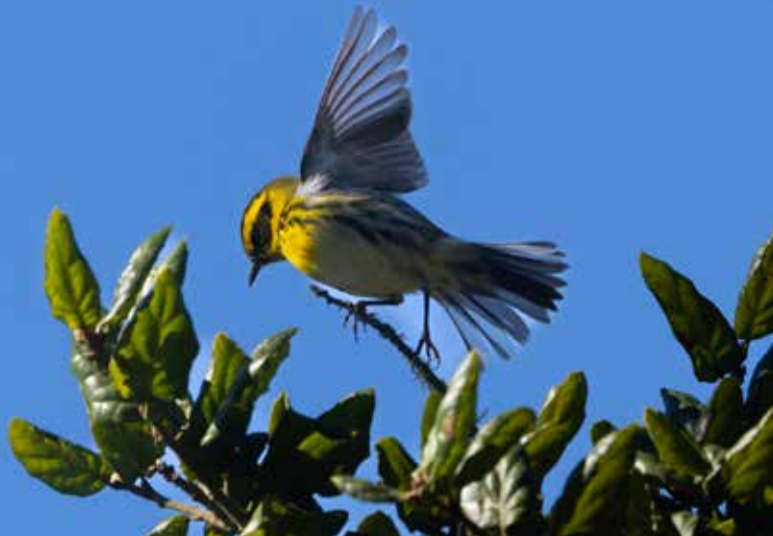
Townsend Warbler