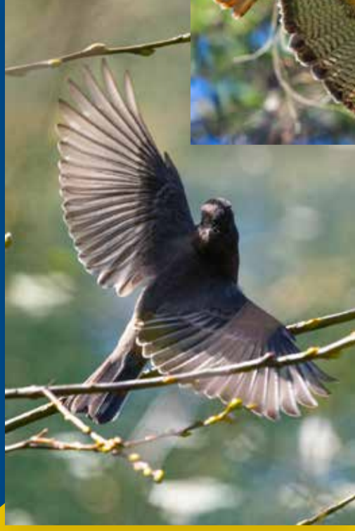
Black Phoebe