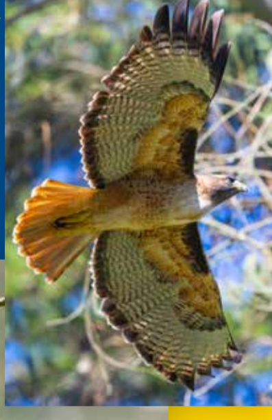
Red-tailed Hawk

San Francisco Nature Education is a 501(c)3 non profit organization. Please support our environmental education programs!