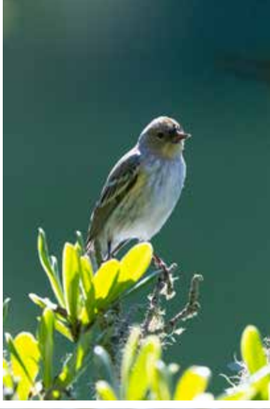
Yellow-rumped warbler

From the Roman Bridge we had another view of the herons' nests and we did a brief survey of the gulls on the boat shed. Heading clockwise we walked onto Strawberry Island. There were Mallards and Canada Geese near the waterfall and a very pregnant woman in her wedding gown having her picture taken.