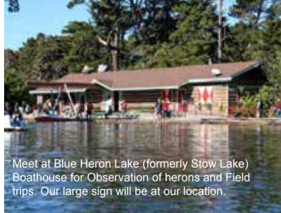
Meet at Blue Heron Lake (formerly Stow Lake) Boathouse for Observation of herons and Field trips. Our large sign will be at our location.

Field trips for adults and families leave from Blue Heron Lake (formerly Stow Lake) Observation Site every Saturday for adults and families at 10:00 AM sharp and return at noon. Binoculars will be loaned to children as needed. Adults should indicate whether they need to borrow a pair on the sign up sheet on the website.