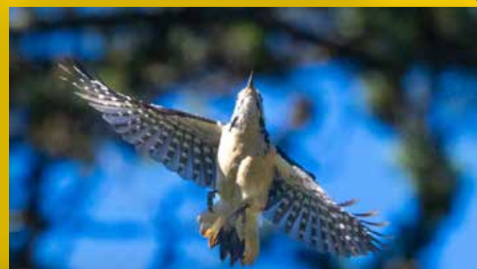
Nuttall's Woodpecker