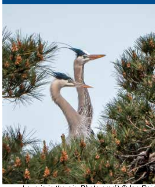
Love is in the air.

Page 2- Trip Report by Alan Hopkins Page 3- Heron Watch Flyer