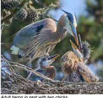
Adult heron in nest with two chicks

Six Saturdays during the Spring Nesting Season in April and May April 12, 19, 26 and May 3, 10, 17 - From 10:00 AM to 1:00 PM - A Free Birding Observation Program -