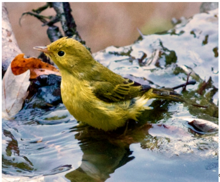
Pacific Flycatcher and Yellow Warbler at Stow Lake Waterfall.