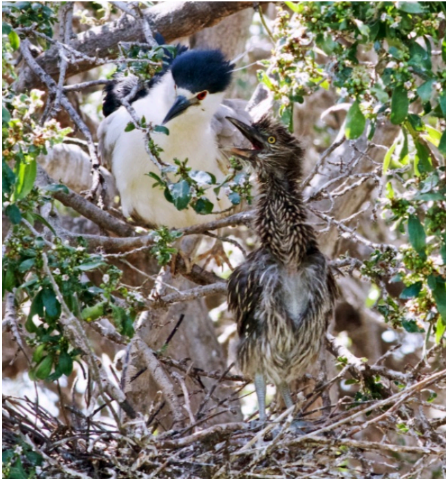
Parent and Juvenile Black-crowned Night Herons