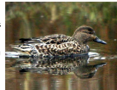
Female Green-winged Teal

These birds matched the female patterns of delicate dappled-brown striping with a buffy patch on the undertail coverts and the eponymous bright green speculum. We spent a few minutes observing these smallest of North American dabbling ducks.