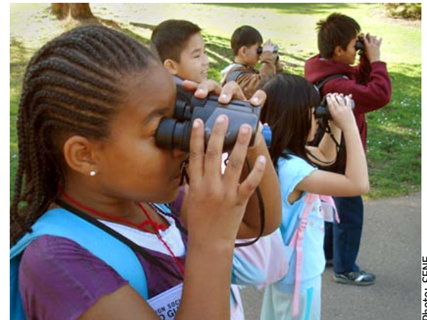
Third-graders birding in the SF Botanical Garden.

For more information, The children and nature network can be found at http://www.childrenandnature.org/ .