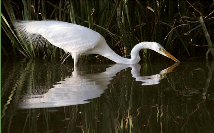
The shaded water makes a perfect mirror: a Great Egret in the Wildfowl Pond.