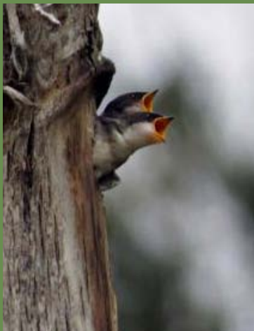
Tree Swallow chicks in the cavity of an agave stalk in the Succulent Garden.