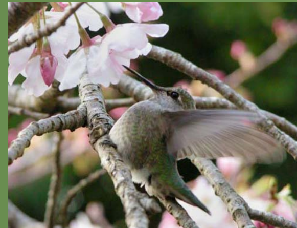
Anna's Hummingbirds can't seem to get enough of the cherry blossoms.