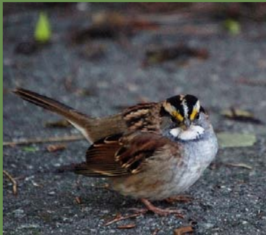
White-throated Sparrows are rarely spotted in the Botanical Garden.