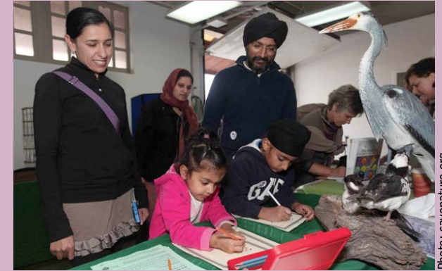
Children draw model birds while their parents look on.

Please visit www.sfnature.org/get_involved for information about how to apply.