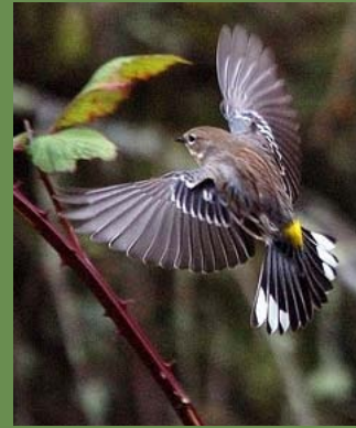
Yellow-rumped Warbler catches breakfast.