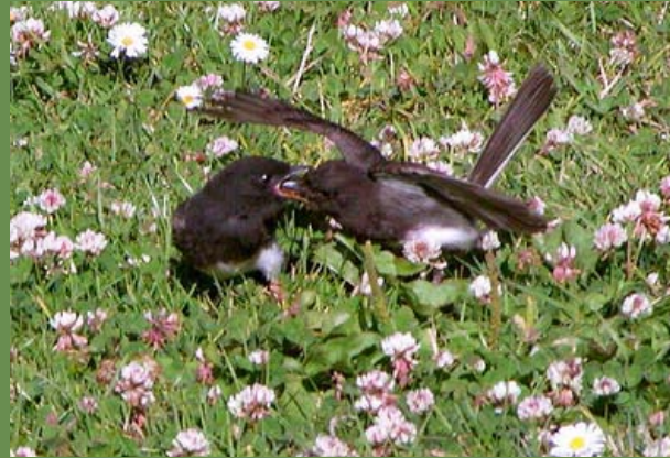
Black Phoebes are among the most commonly seen species.