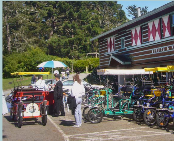
The Stow Lake boathouse and its wheeled vehicles for rent.