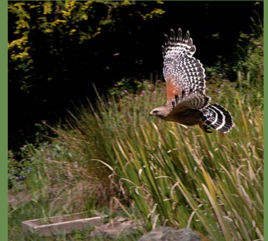
Red-shouldered Hawk heading off to another spot.