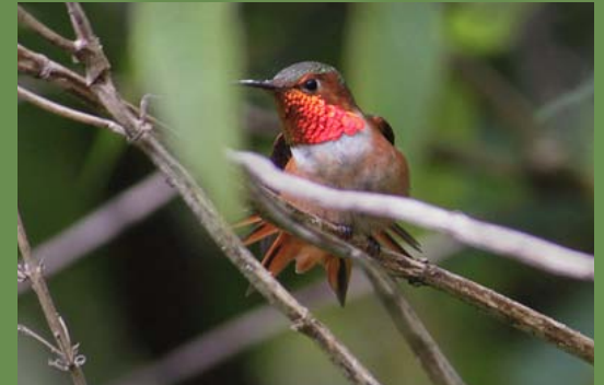
Allen's Hummingbird with tail feathers on display.