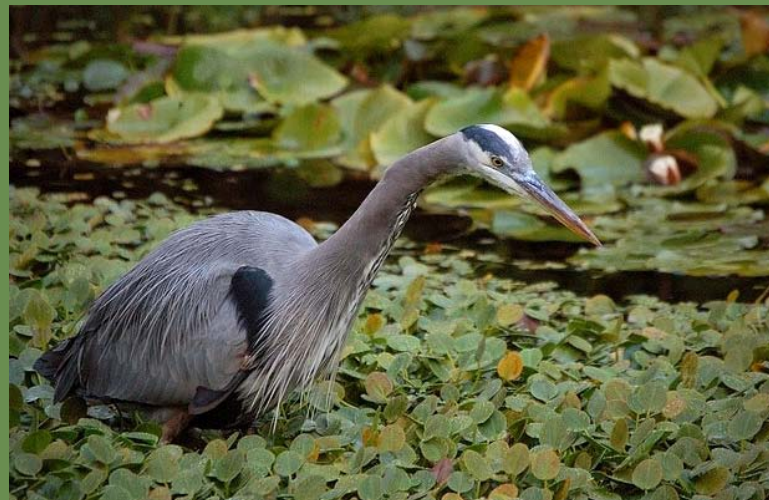
Great Blue Heron stretching out for a better look.