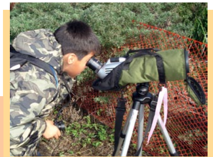
School program 2008.