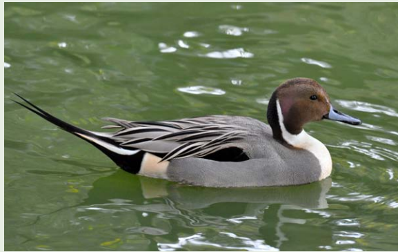
Northern Pintail, Stow Lake