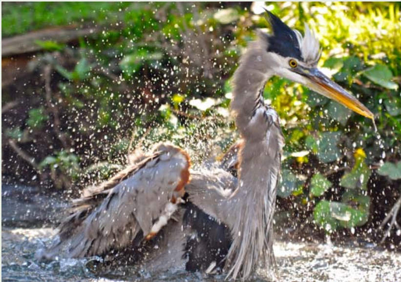
Great Blue Heron bathing