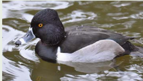
Male Ring-necked Duck, Lloyd Lake