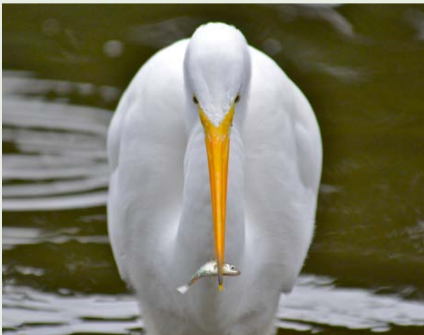
Great Egret with tiny catch