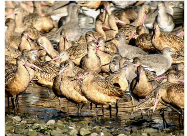
Marbled Godwits on alert in nearby Bodega Bay