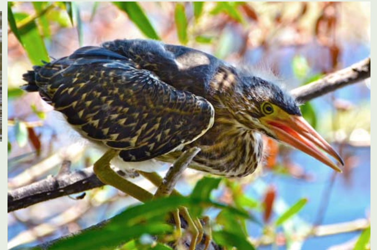
Green Heron chick, Heather Farms, Walnut Creek