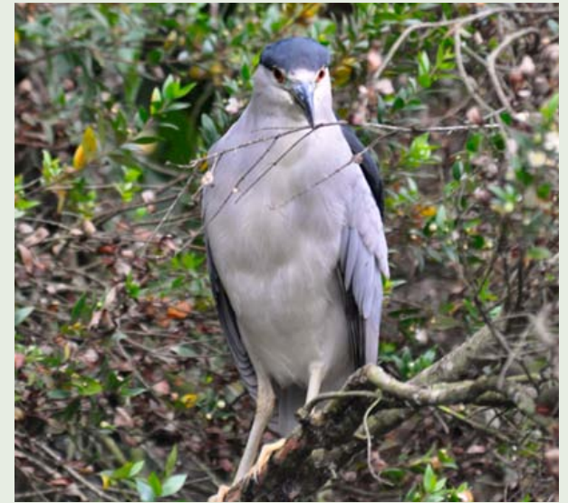
Black-crowned Night Heron