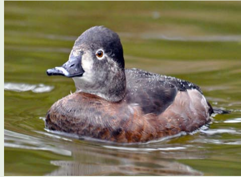
Female Ring-necked Duck, Lloyd Lake, Golden Gate Park