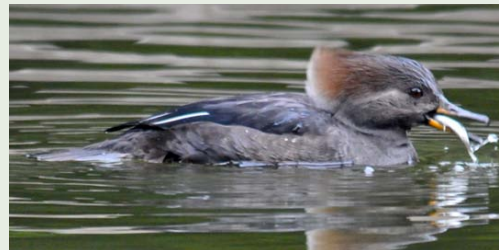
Female Hooded Merganser with fish; below, male Hooded Merganser.