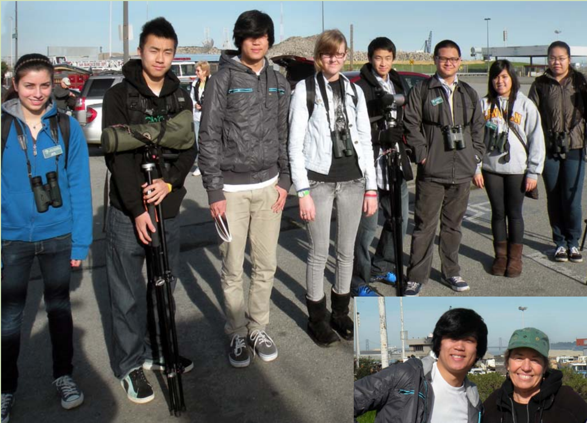
Interns are equipped and ready to lead the first public tours of the season.