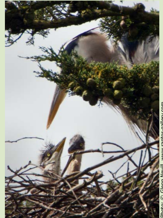
Adult heron watches over two newly hatched chicks.