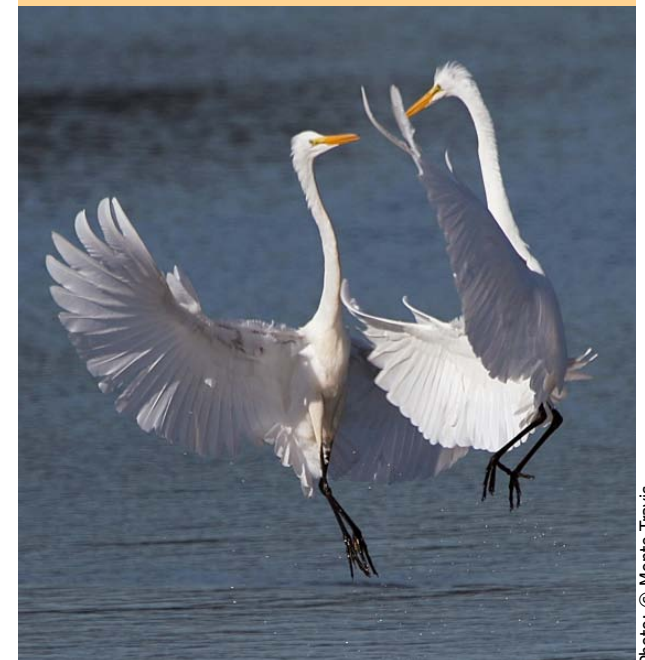
Dancing egrets at Crissy Field in San Francisco.