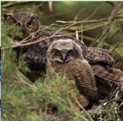
Great Horned Owl with an owllet at Stow Lake.