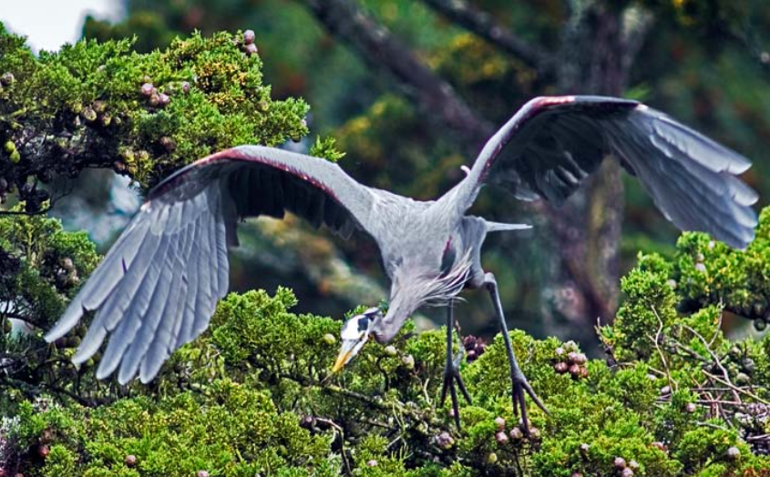
A Great Blue Heron above its nest on Heron Island.