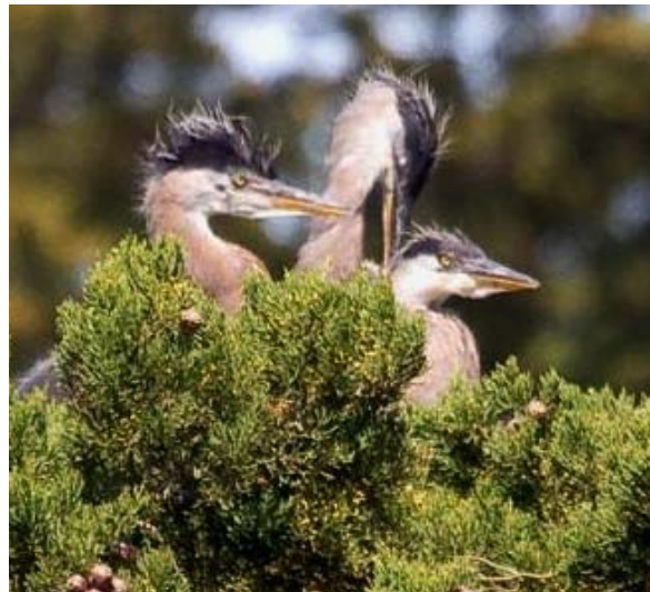
Three young heron chicks.

There are only three more Saturdays left to look through our spotting scopes and participate in our nature walks. Please come by to experience this yearly San Francisco phenomenon with us!