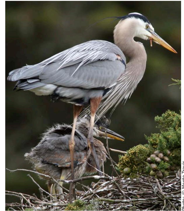
Parent heron with injured tongue stands guard over chick.