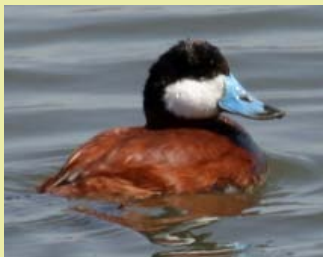
Ruddy Duck in breeding plumage