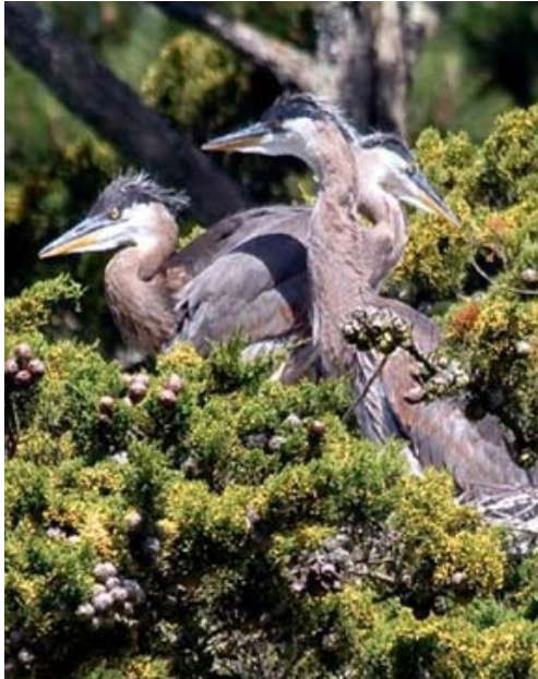
Heron chicks (above) in their treetop nest at Stow Lake.