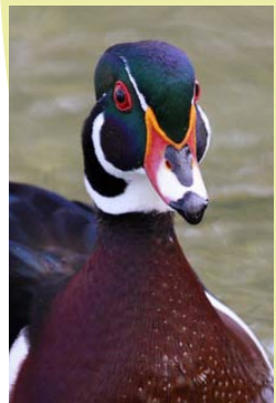
Wood Duck—the highlight of the day