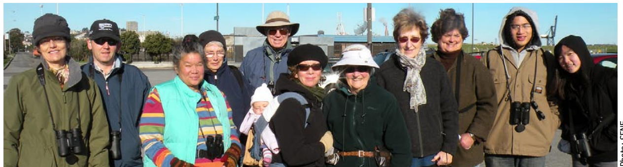
Opening Day crowd for first tour.