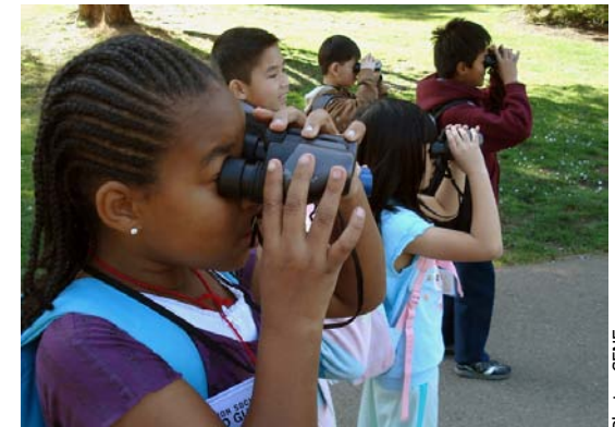
Using binoculars for birding in the Botanical Garden.

We caught glimpses, in the surrounding grasses and brush, of a European Starling, an American Kestrel, and an American Crow. Smaller birds included the iridescent Anna's Hummingbird and the Savannah Sparrow.