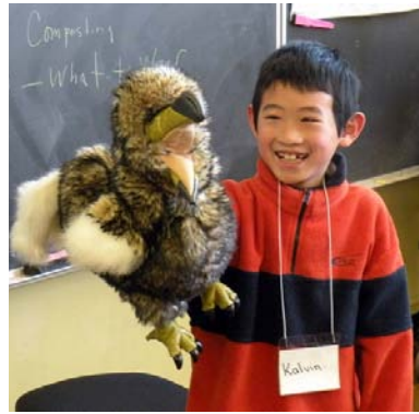
Student explains how the Dodo became extinct.