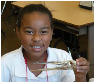
Handling a Great Blue Heron skull in the classroom.