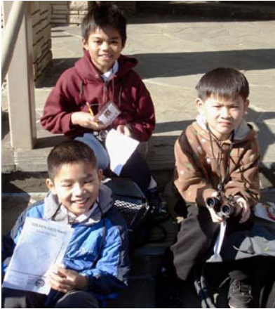
Preparing to sketch in their journals.