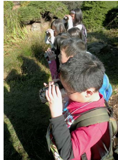
Bird watching with binoculars in the field.